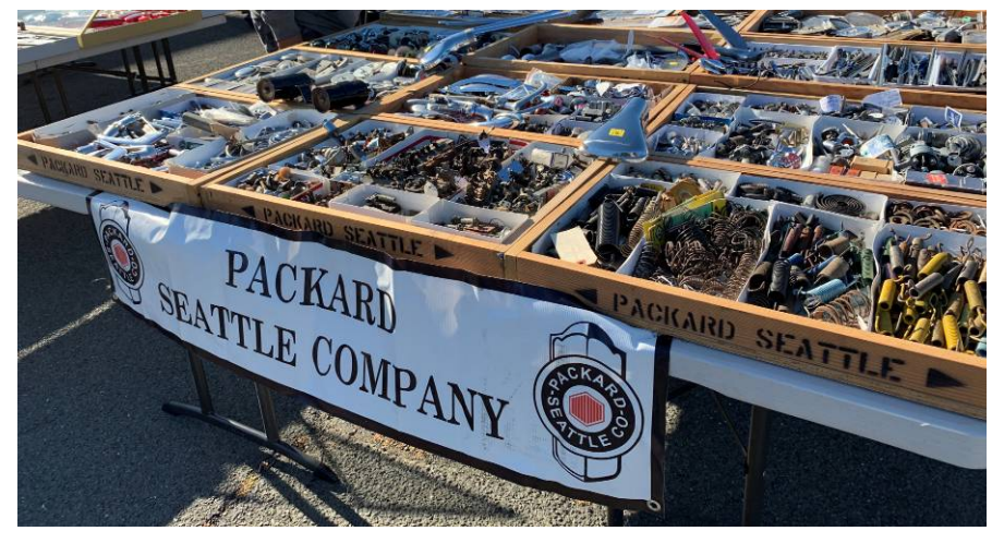
The Packard Seattle Company table at the swap meet was a treasure trove!

Leaving my home in San Jose, I paused to observe the clear blue sky and thought "what a beautiful day for a swap meet." Having never been to the annual event at the World Classics Center in Vallejo, I didn't know what to expect, but I was a man with a mission: I wanted to find parts for my newly acquired 1934 Packard 1100 Sedan.