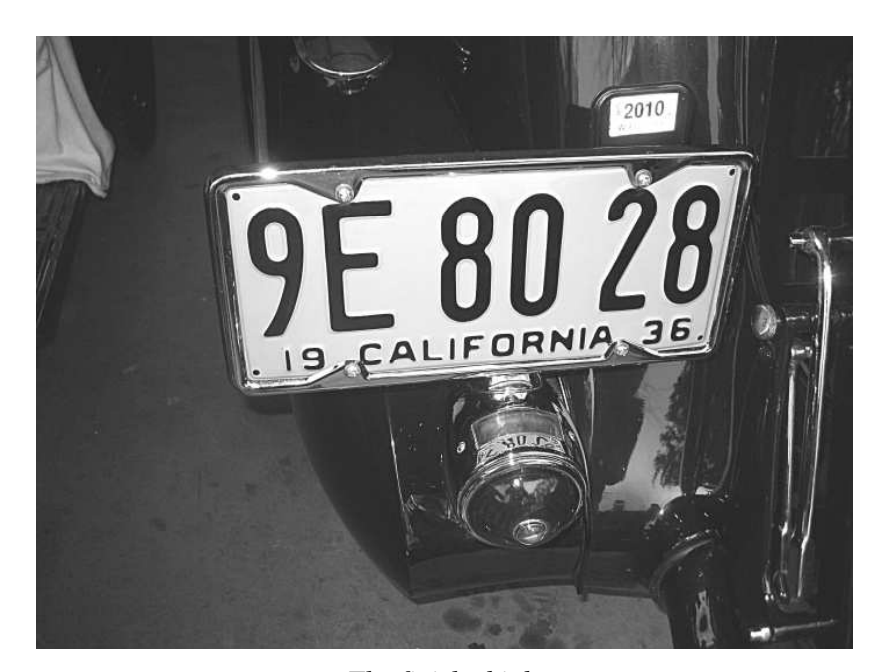
The finished job.