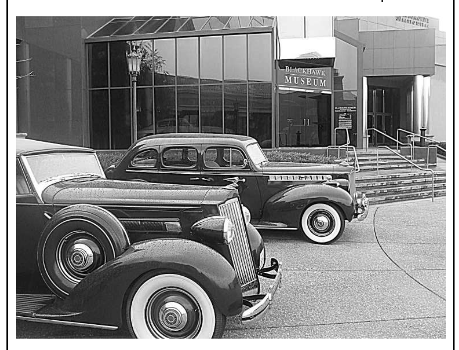
The McCoy's '36 120 and Bergeron's '40 110.

After a deli-style lunch, we visited the European Train Enthusiasts model train exhibit and then returned for a special