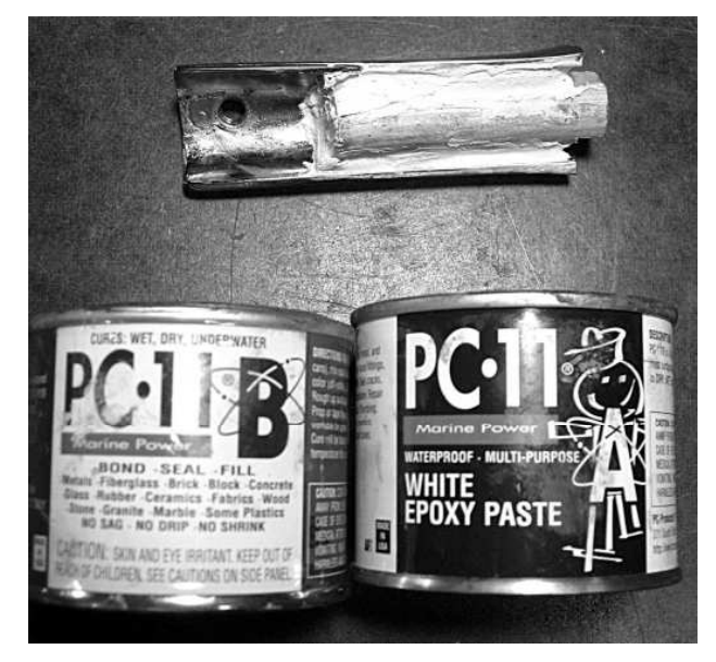
Two-part epoxy bonds the dowel to the broken piece.