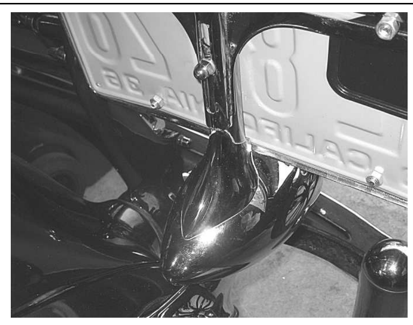
The repair is barely visible.