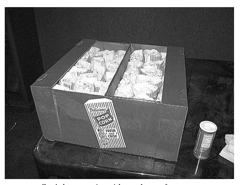
Can't have movies without plenty of popcorn.

ONLINE SPECIAL: Order both DVDs for only $35, with free shipping.