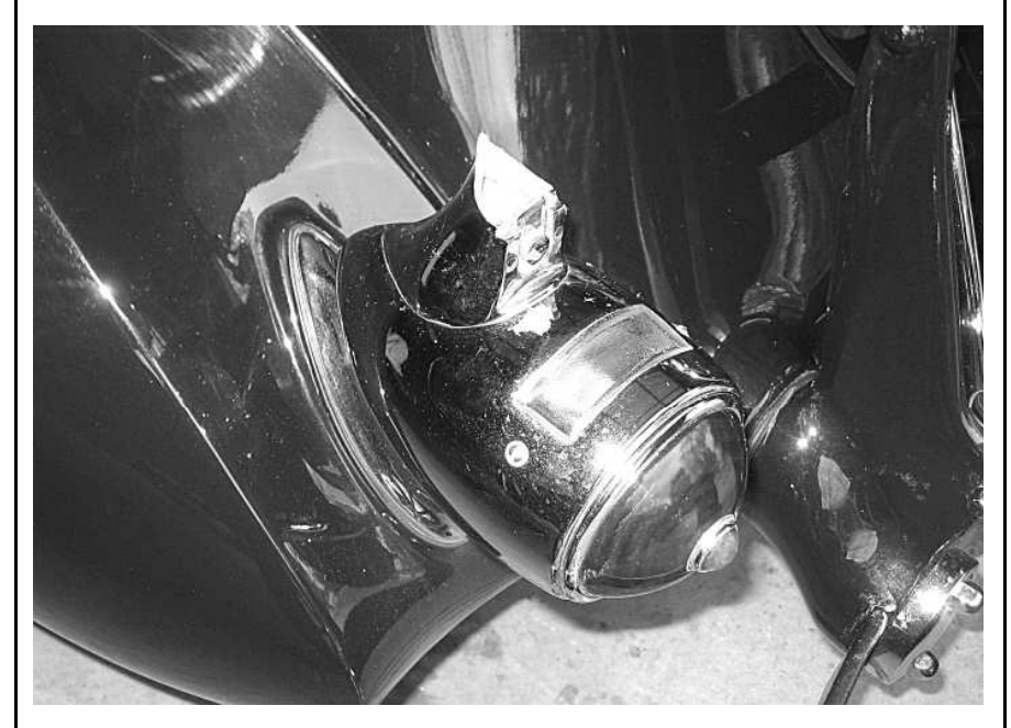
We all worry about these fragile stanchions; it only takes a light bump on the license plate to break the old, crystallized pot metal.