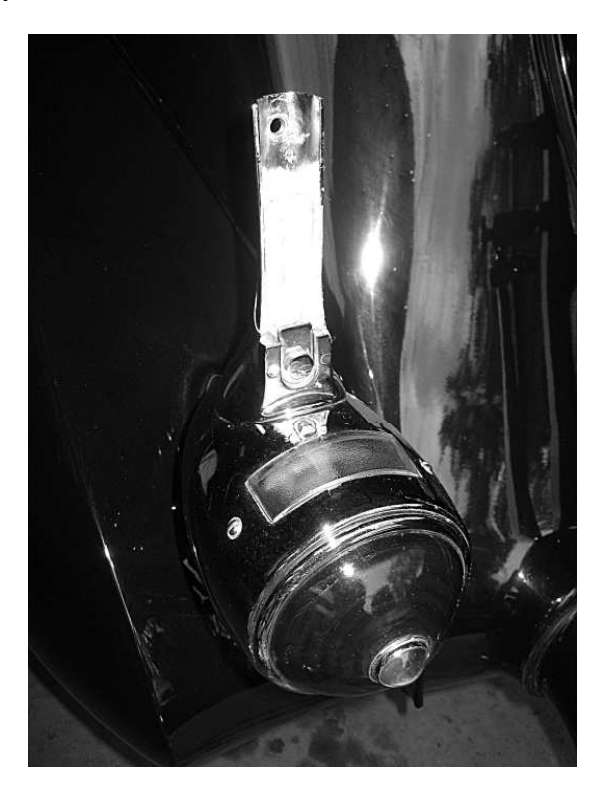
The epoxy repair will be hidden by the license plate.

Now, does anybody by chance happen to have a left tail lamp assembly for a 1936 Packard Standard 8 that they would be willing to part with? Of course, I would like to replace this temporary repair when the correct part can be located.