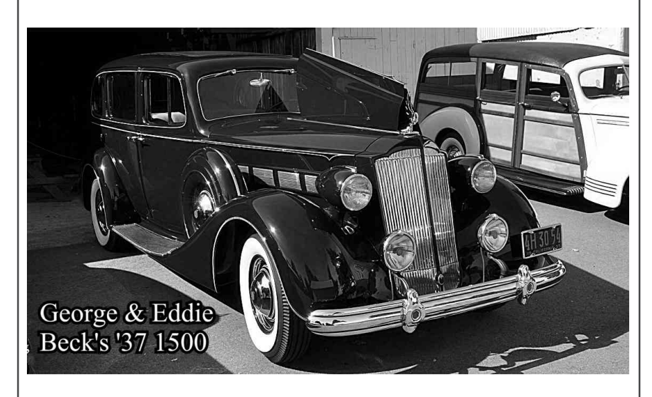
If a certain Packard had behaved, it would have looked like this at last year's visit, seen here next to Ron Carpenter's '41 wagon.