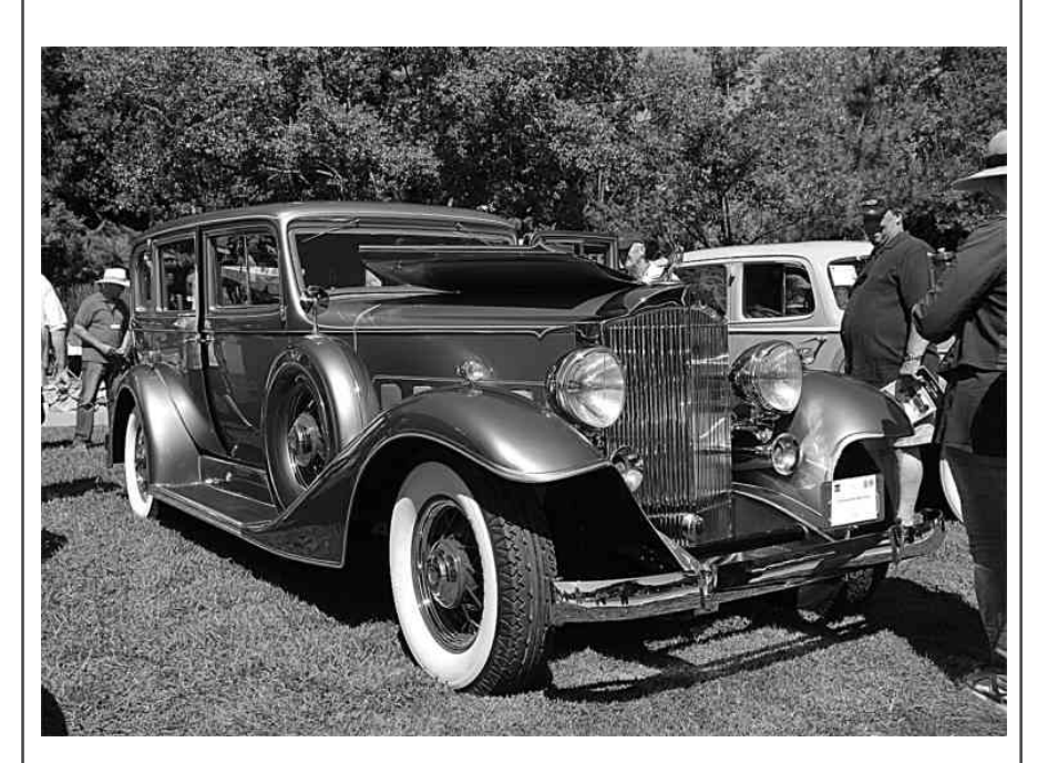
Jon Fuiks' '33 1003 sedan.