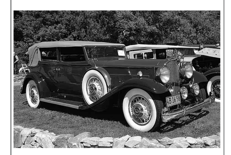
Clint Moore's '32 903 Dietrich convertible sedan.