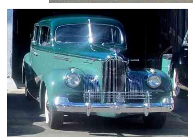
Morrison '41 120