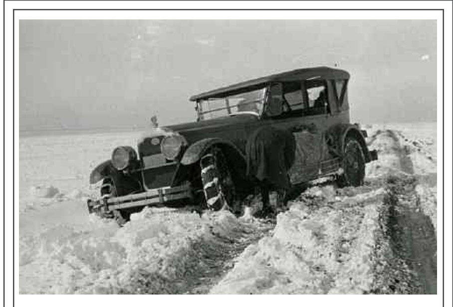
MYSTERY PHOTO - Part 2