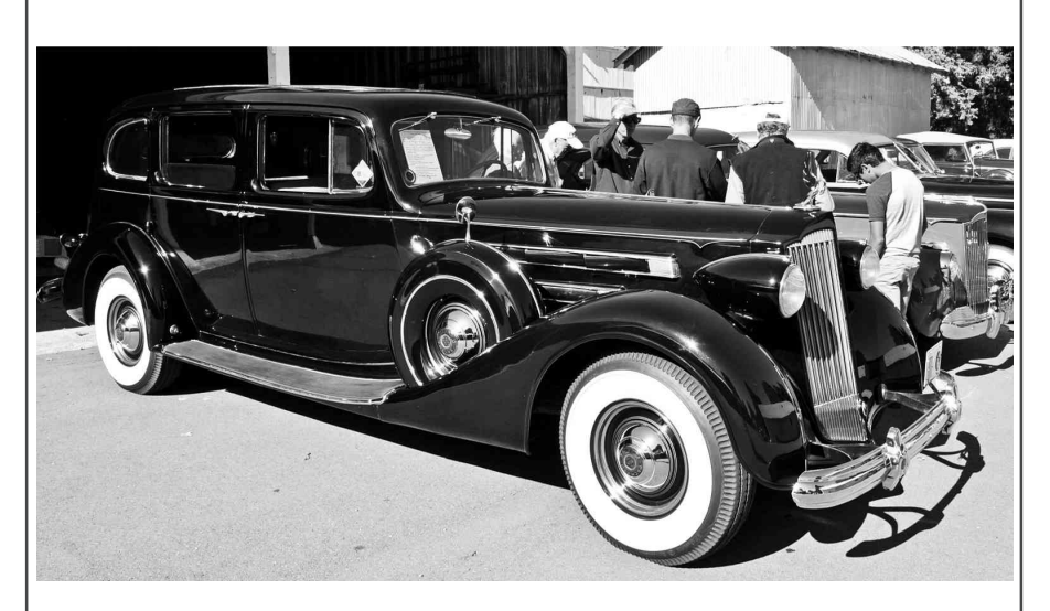
Bud Juneau's '37 V-12 1508 is named "Helen Twelvecylinders" after screen star Helen Twelvetrees.