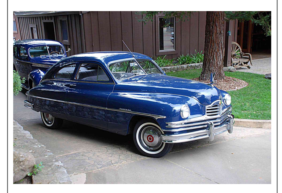
The Carpenter's '49 2301 club sedan.