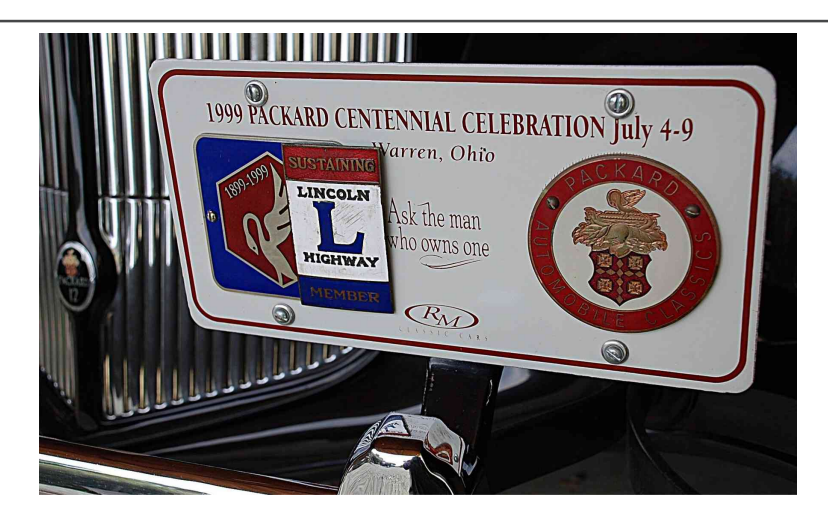
This Lincoln Highway membership badge is likely from 1913-14.