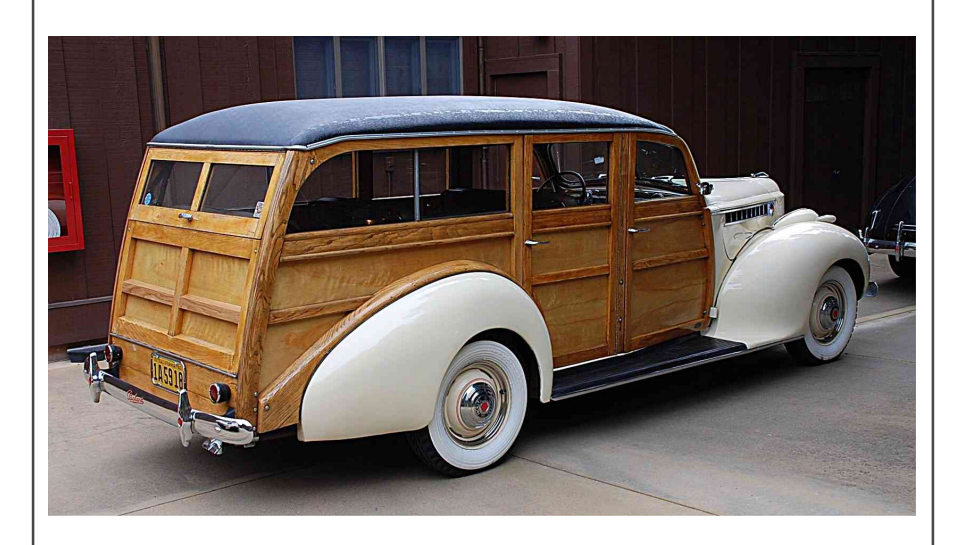
Bruce & Rhonda Cummings brought their rare (even though we have two in Nor-Cal) station wagon.