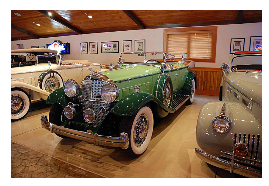
This '32 903 Eight De Luxe sport phaeton would be a perfect choice for an evening's drive on a warm summer night.