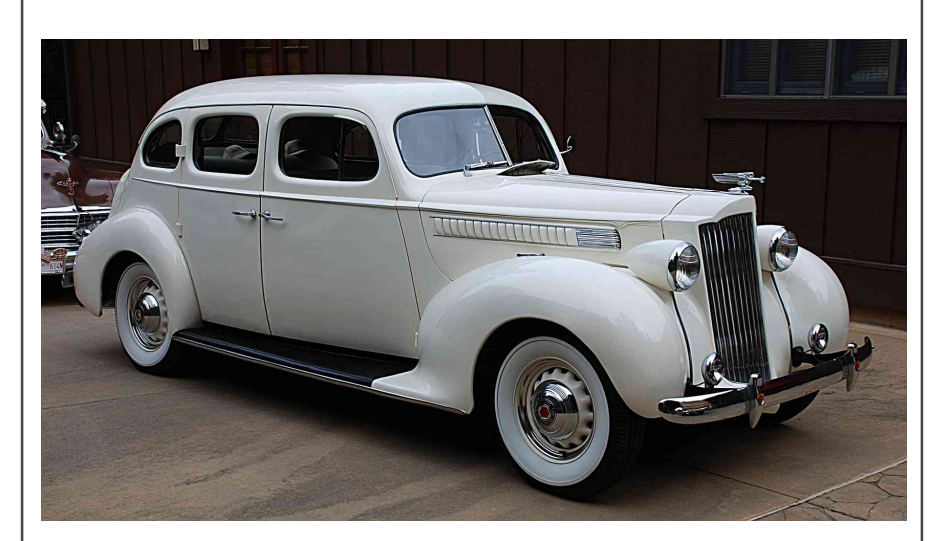
The Blazeks' '39 1700 sedan.