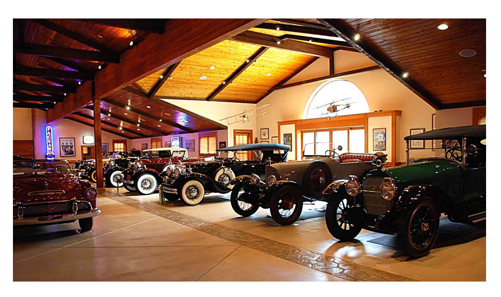
A neon Packard sign decorates the back wall of this display area that opens to a patio; perfect for circulation during an event..