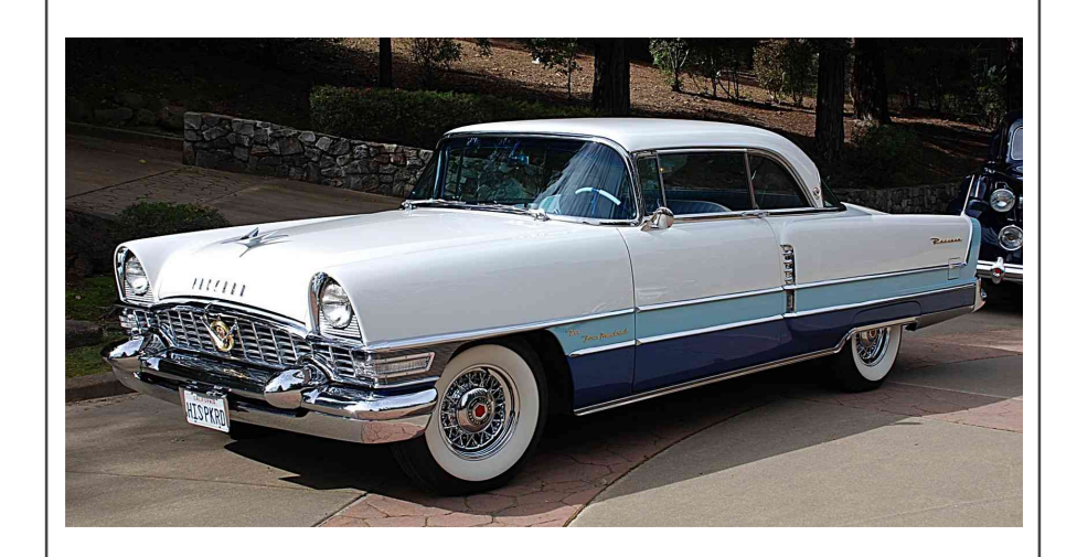
The.Hill's '55 400 HT.