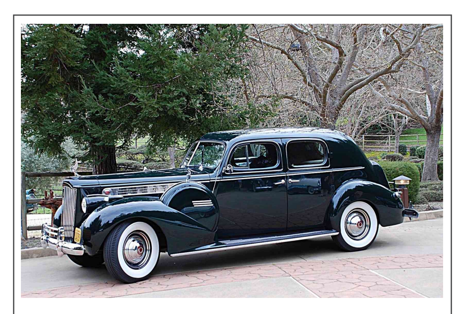
The Butterworth's '40 1806 club sedan.