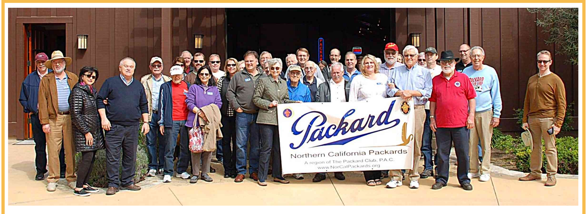
A fine looking group of Packard enthusiasts in front of one of the Carter's showroom buildings.