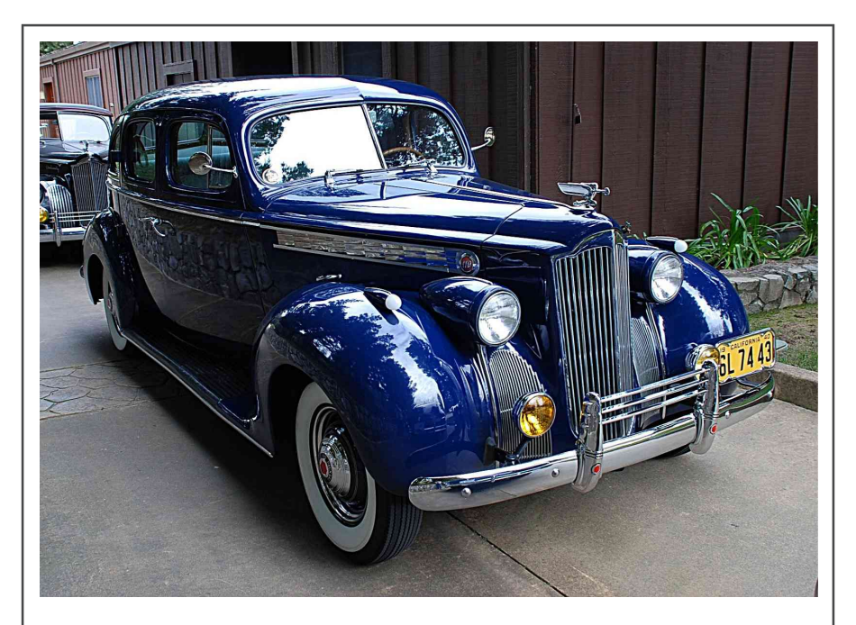
The Higgins' '40 1800 sedan.