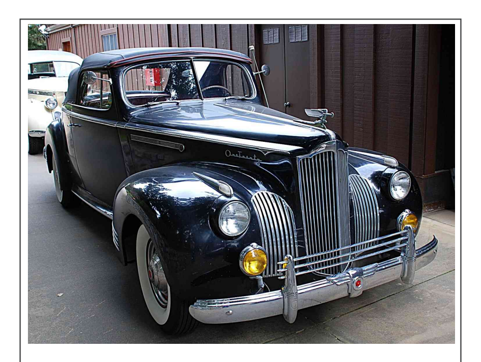
James Laughlin's '41 120 convertible coupe.