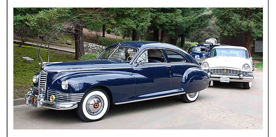
Our Packards were parked in the driveways between the buildings and made a nice display of their own. Here we see Henry Hopkins' latest acquisition - a beautiful '47 Custom Super Clipper club sedan. The car has many interesting accessories and is gorgeous.