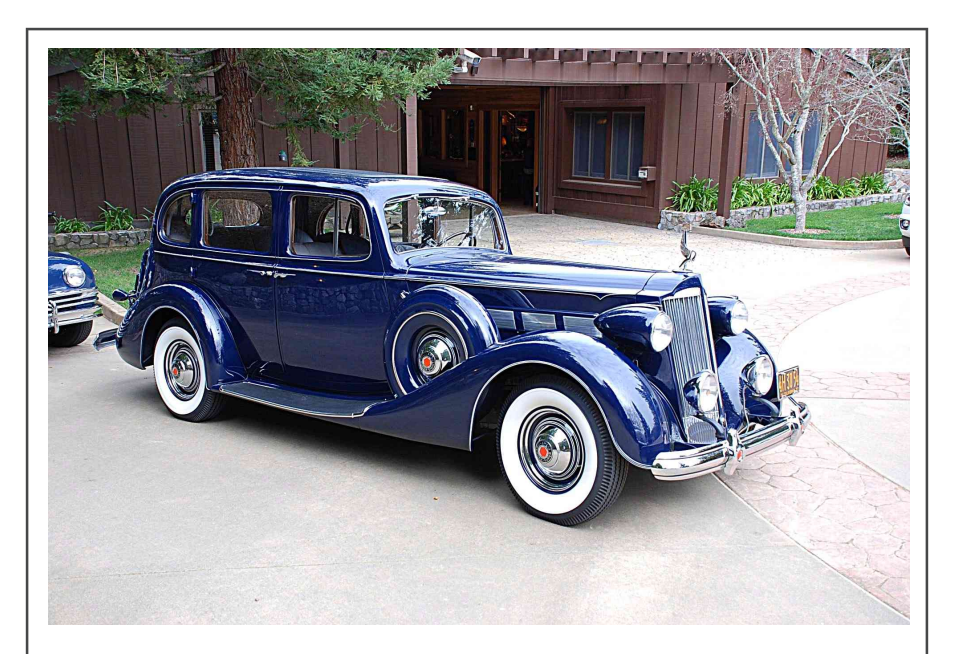
The Beck's '37 1500 touring sedan.