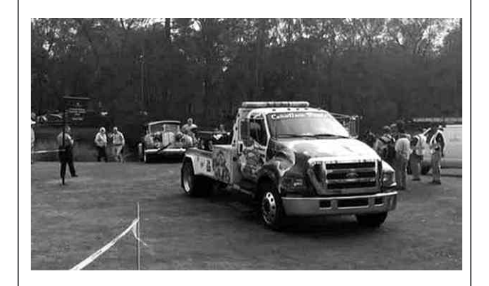
The tow truck pulled the car out using its cable.