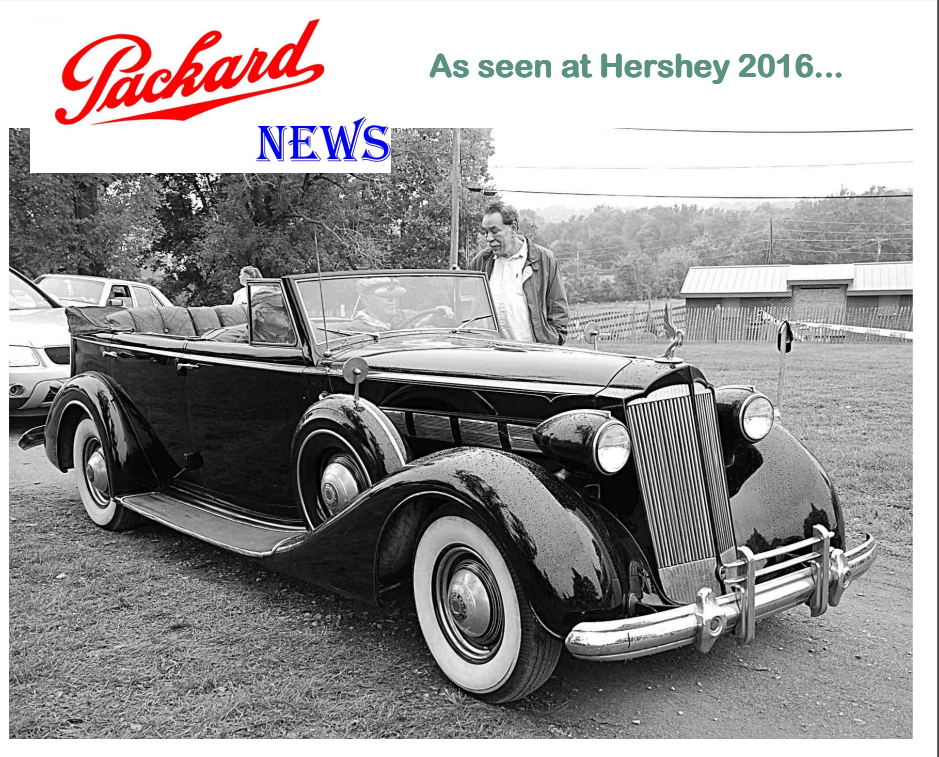
Above: '37 Roosevelt parade car in Preservation Class. Below: Mervin Afflerbach's '49 Custom Eight.