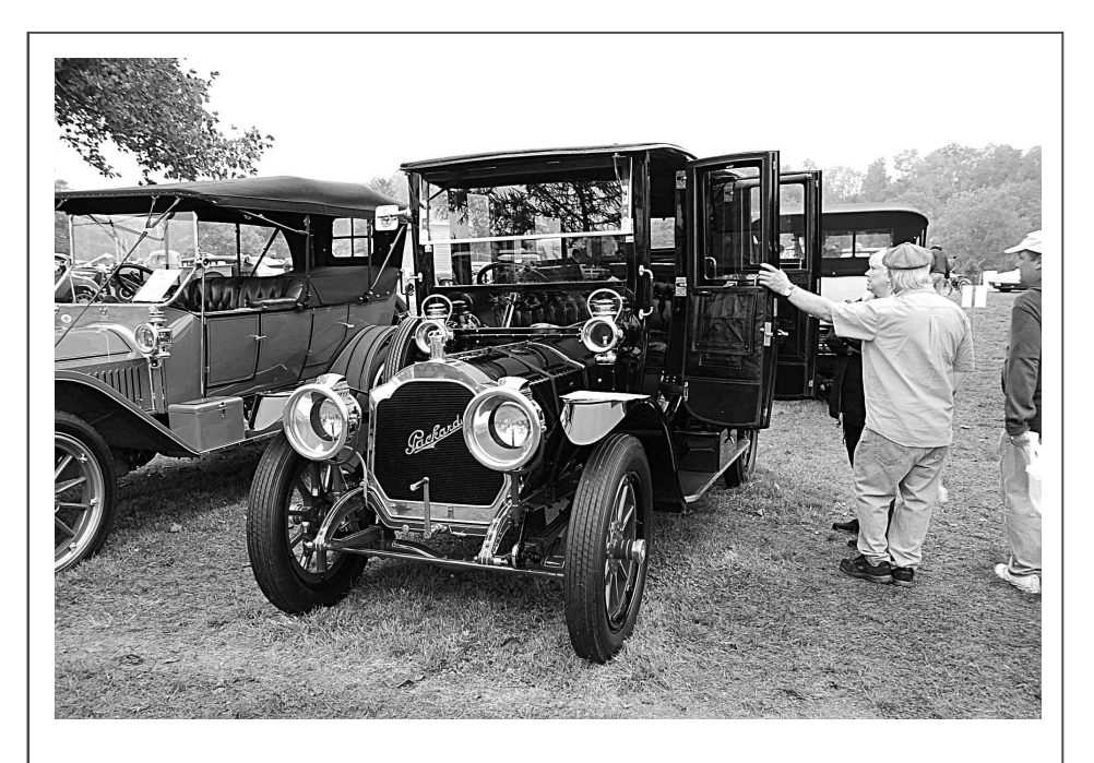
Above: '11 Thirty 7-passenger Berline limousine.

Below: I could not resist a photo of this '23 O'Connell Super Truck with crew cab, able to be driven in two directions; all original and still running strong.