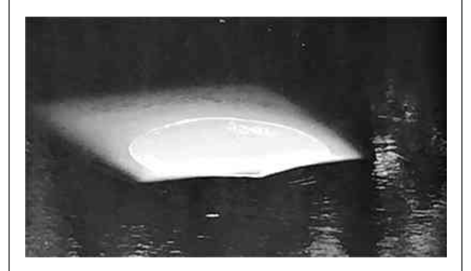
The leading edge of the custom hardtop roof was all that was above water.

Our sincere condolences go to Ralph, and we look forward to seeing the car back on the road soon.