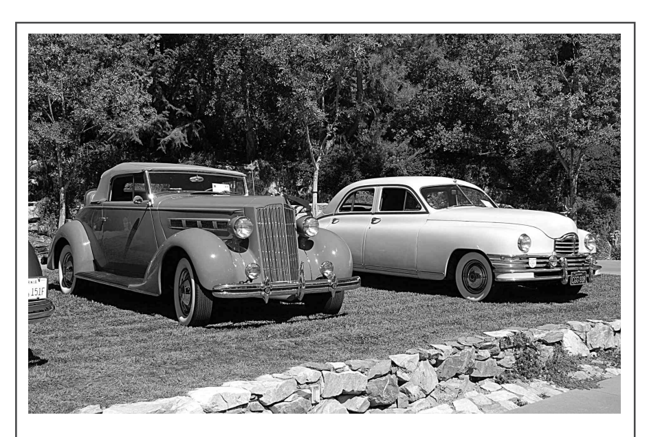
Rod Smith's '37 120 convertible and Clint Moore's Deluxe Eight sedan.