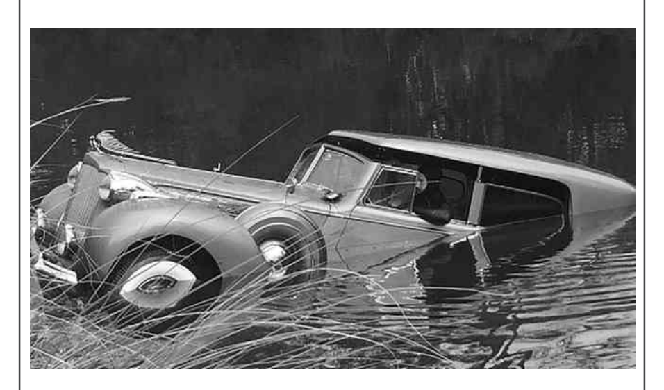
The diver steered as the car was pulled slowly out of the water.