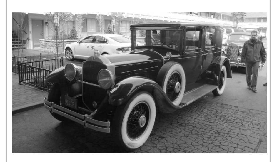
The Chesnutts' 1929 640 club sedan.