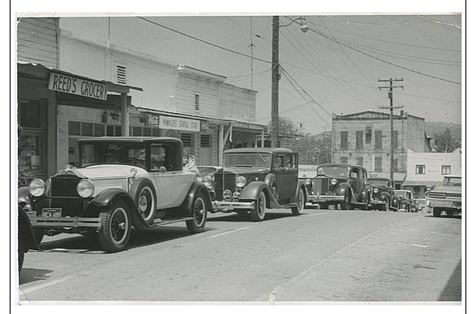
Nor-Cal tour at Mokelumne Hill in the sixties.