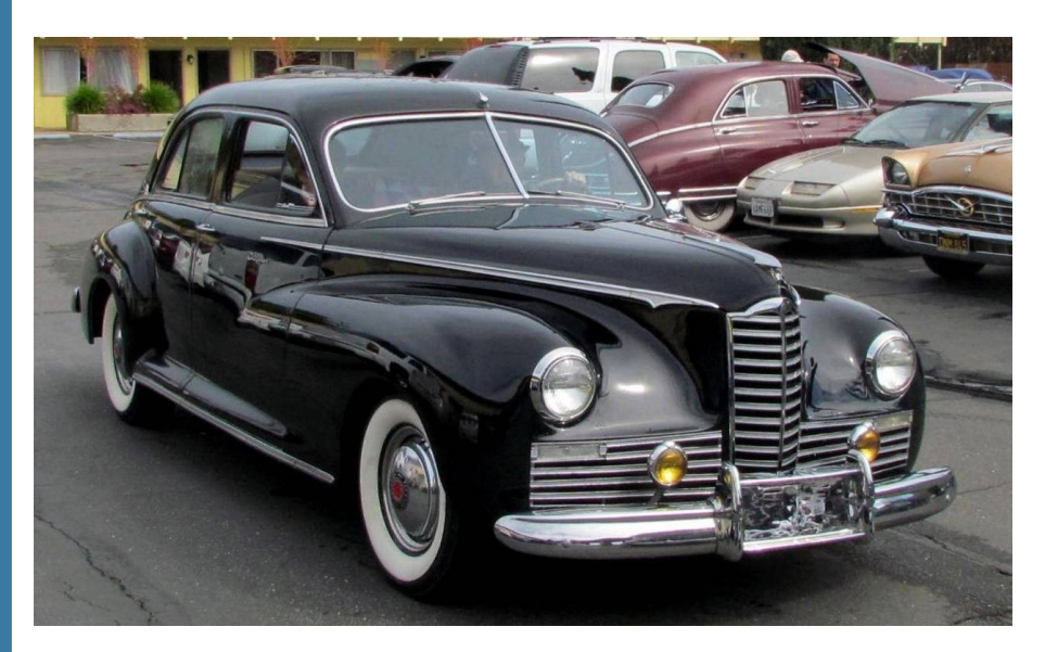
The Carreres' 1946 Clipper sedan.