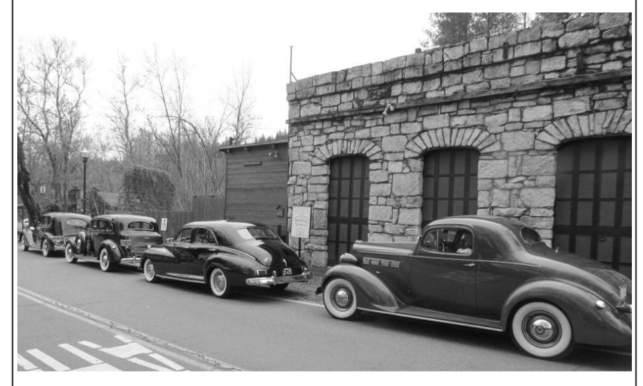
Another view of the caravan ready to tour.