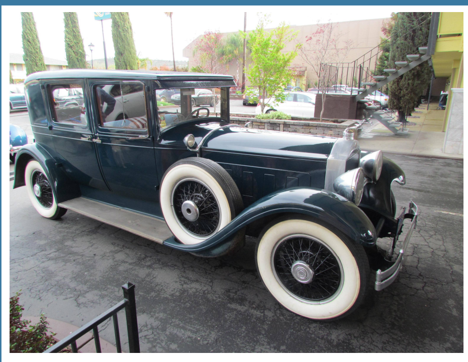
The Chesnutts' 1929 640 club sedan.