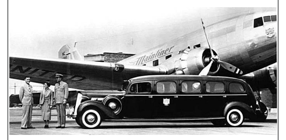
This is a '37 120 8-door airport limo, on an extended wheelbase, parked by a period United Airlines Mainliner. Looks like a posed publicity shot. A few of these stretch-jobs have survived.

Somebody will probably write in with more information, but I have always liked this low-angle shot of what may have been Darrin's first '38 conversion. Of note are the spinners on the hubcaps, the parking lights on front fenders, and extra running lights.