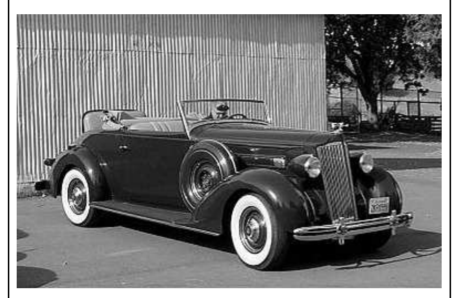
The McCoys' '36 120B 999 convertible coupe.