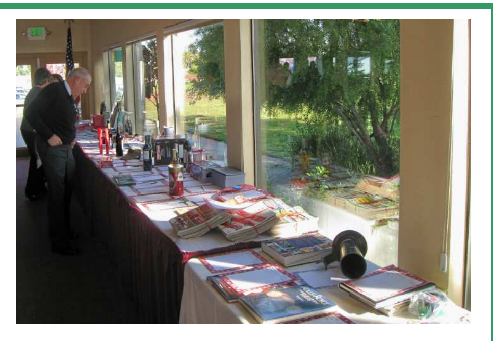
The raffle table always holds treasures.