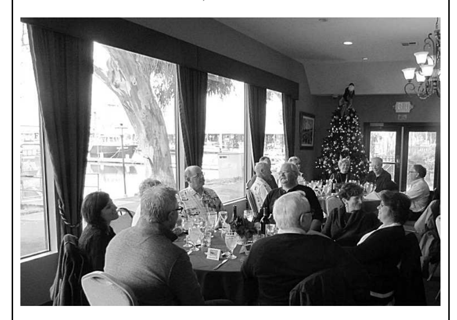
Our dining room included a Christmas tree in the corner and a nice view of the boats in the Marina.