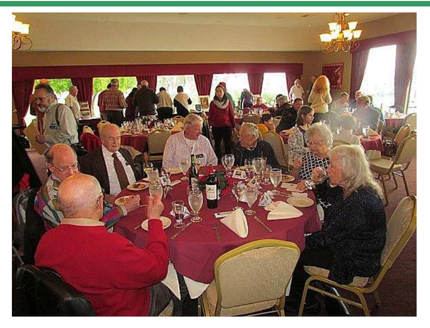
The Holiday Luncheon room was warm and inviting.