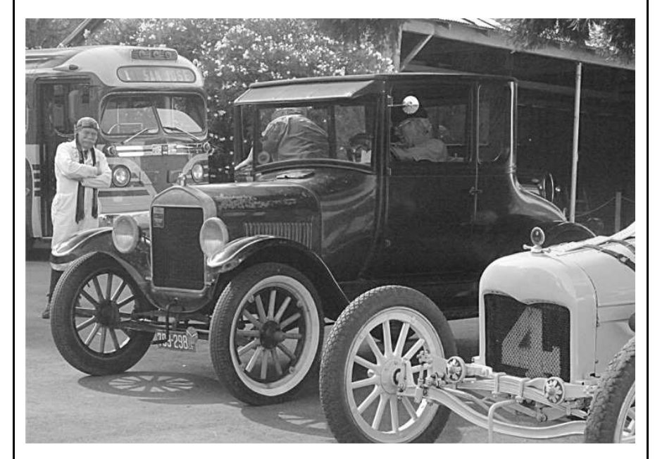
Horseless Carriage Club cars with a bus from the Freemont Bus Museum in the background.