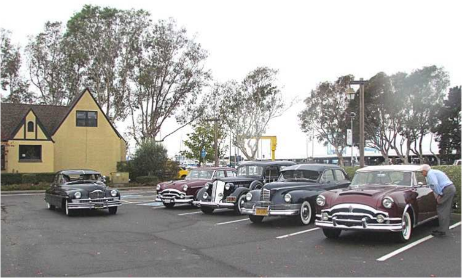
Brave members proved that Packards don't melt in the rain.