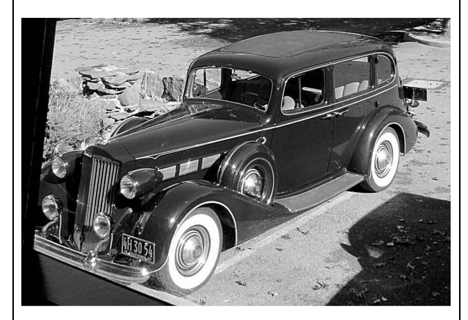
George & Eddie Beck's '37 1501 Super Eight sedan.