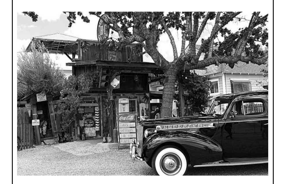
The Automobile Driving Museum's '40 by a scenic old-time service station.