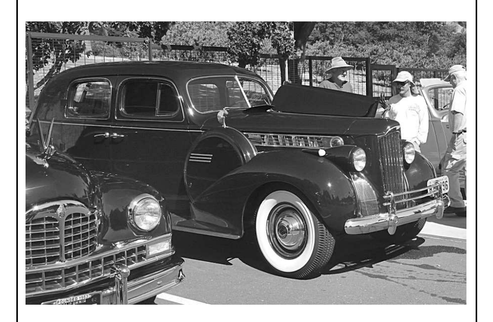
The Butterworth's '40 160 club sedan.