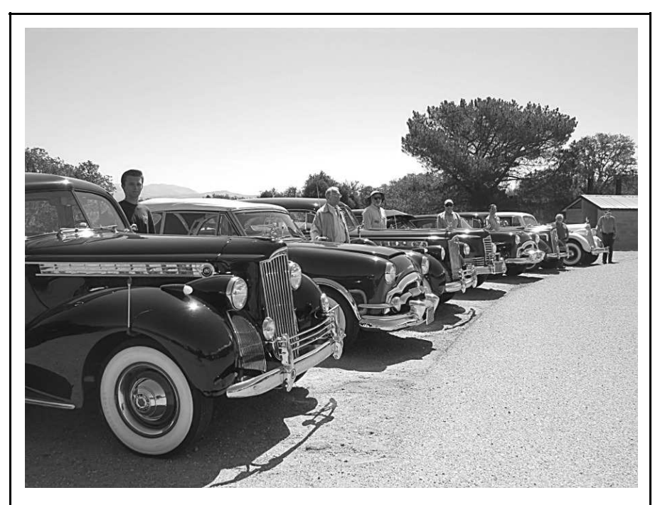
Cars and their drivers at the Bradbury dam.