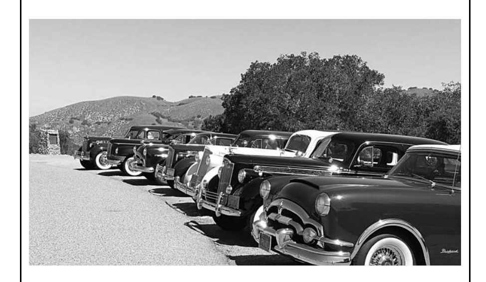
Lineup of Packards at Bradbury dam.