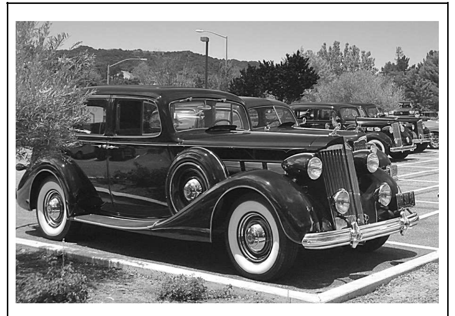
The Becks' '37 Super Eight.