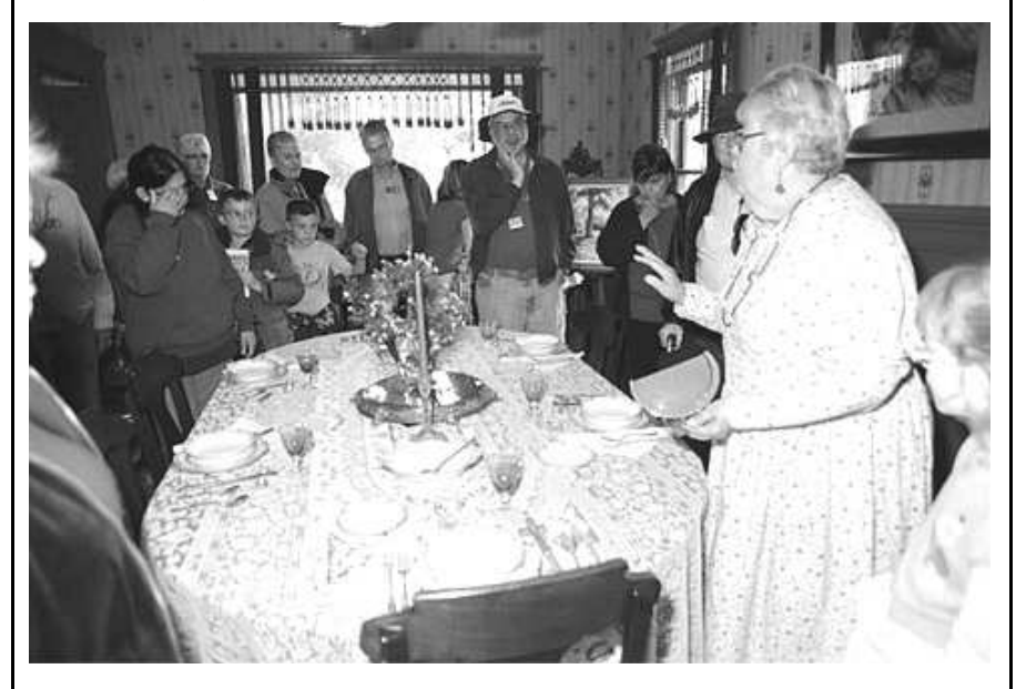
Part of the group in the Patterson house dining room.