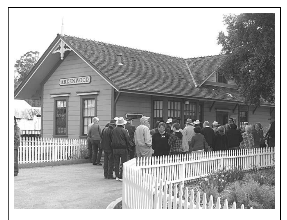
The group entering through the restored train station.

Waiting for its turn for a restoration is this 1937 Twelve club sedan at Fred Hill's garage.