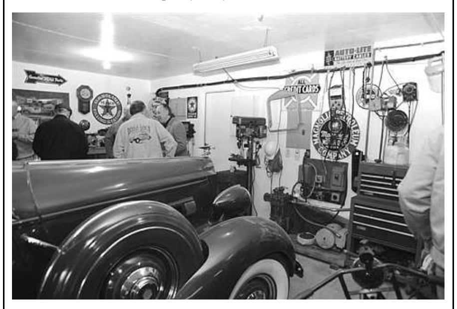
A final view of the McCoys' garage ends our report on the 2011 garage tour.

The McCoys' '36 convertible coupe next to a couple of early motor scooters.