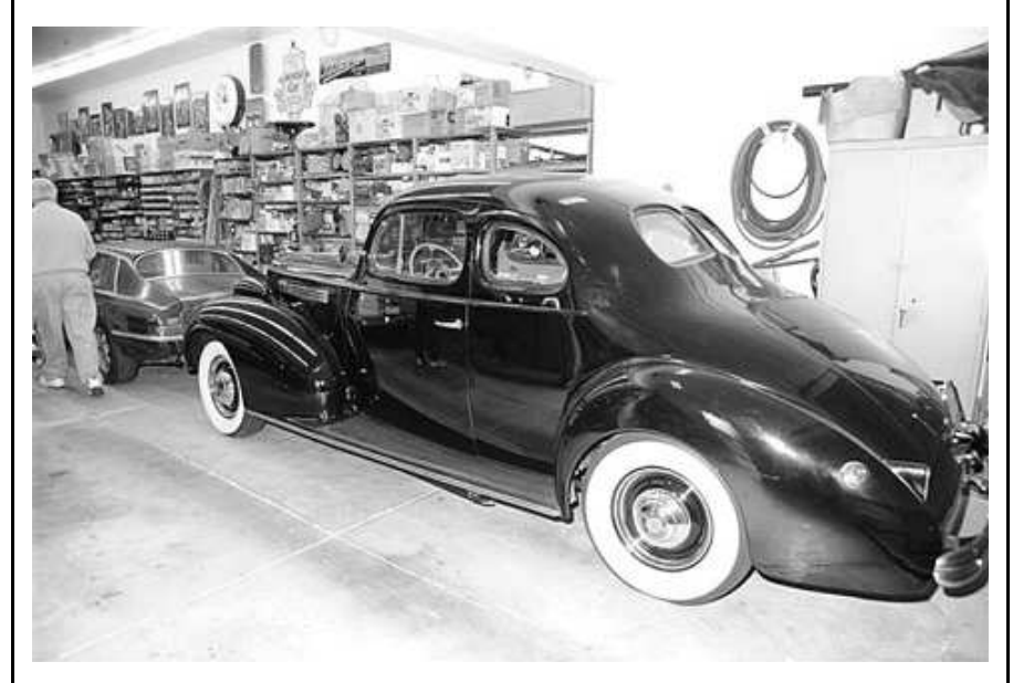
Fred Hill's '39 coupe next to a wall of well-organized Packard parts.