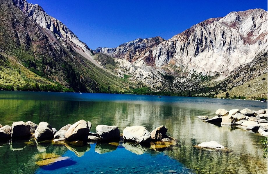
Pristine vistas and crystal clear waters on the June Lake Loop!

Silver Circle Packards invites you to attend the Western Regions Tour in the stunning eastern Sierra Mountains at the end of June. The annual trek is not only a weekend away in your Packard, but also a chance to reconnect with old friends! Our slope-side accommodations will be at The Mammoth Mountain Inn, and the proprietors are excited to see our cars gleaming in the parking lot.