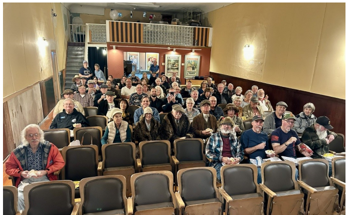
Our group of more than 60 people filled the seats for the show in the Edison Theater!