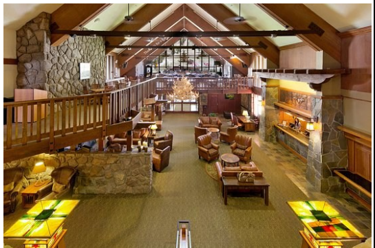
The A-frame lobby of our alpine accommodations.

You'll want to arrive Wednesday, June 24 because Thursday, June 25 will be a full day of sightseeing. The