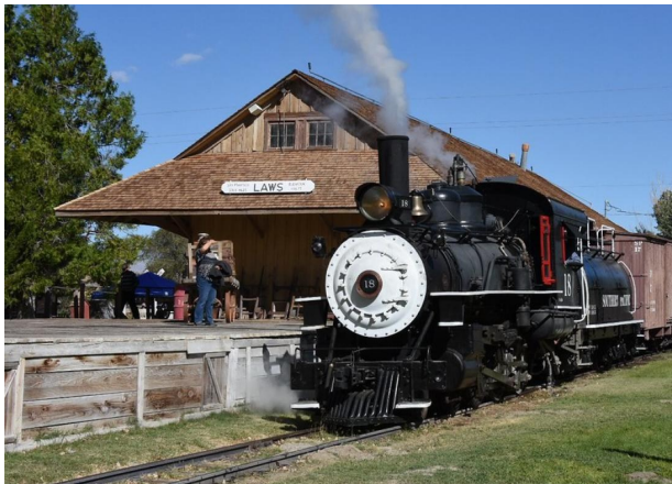
One of the many locomotives to see at the Laws Train Museum.

Registration forms have been sent by email and should be mailed in soon!