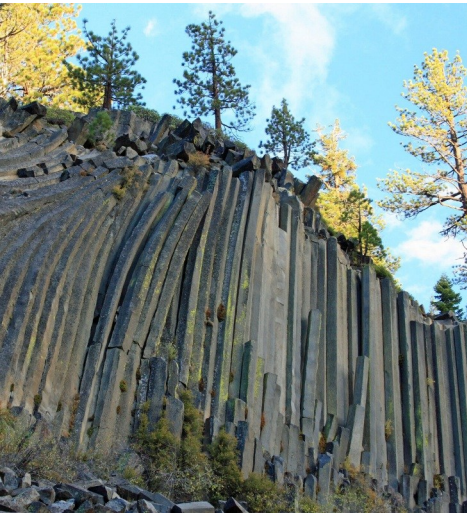
Crazy rock formations at the Devil's Postpile.

first excursion will be a shuttle ride to take in the wonder of Devil's Postpile National Monument (no cars allowed to the monument) followed by lunch at the Mammoth Brewing Company.