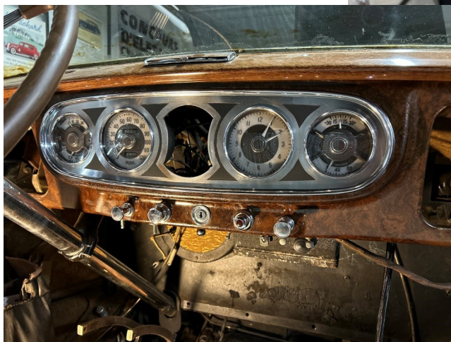
Bottom: The dash "oval" after being cleaned, painted, re-wired and reinstalled. The radio head will be put back once I confirm the car runs without catching fire!