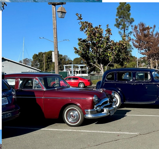
Below: The Natcher's 1941 120 Sedan is beautifully offset by the fall colors in the parking lot at Zio Fraedo's.