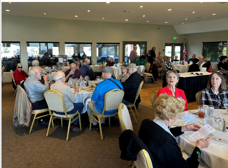
Above: A room full of happy Packard people enjoying the holiday luncheon at Zio Fraedo's restaurant in Vallejo.