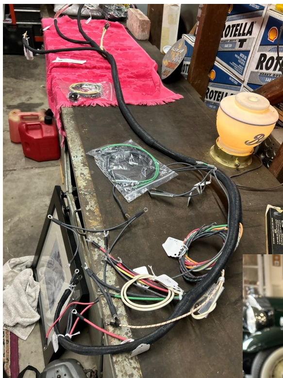
Top: The beautiful new 8-foot-long main harness (dash board section in foreground) from Potomac Packards laid out on the workbench. Everything is clearly labeled, and the harness is pre-wired for turn signals and an electric fuel pump switch. So modern!