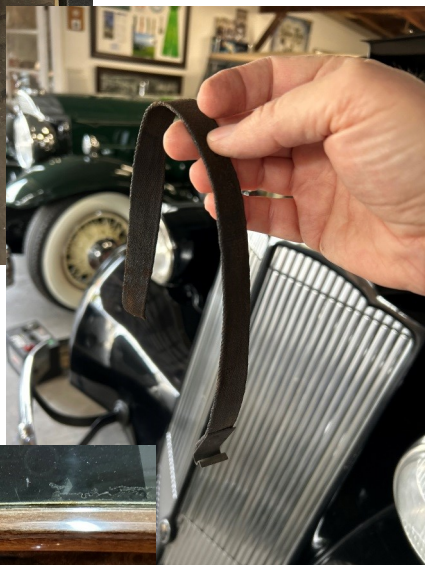
Middle: It's amazing what you find! This original hood limiting strap, which I thought was lost, had broken off and was hanging from the frame under the steering column.