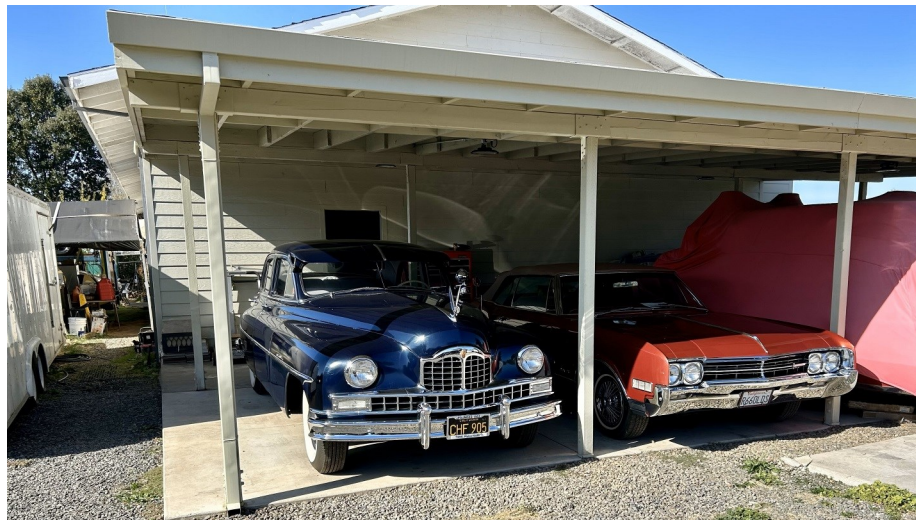
Gerry Wuichet's 1950 Super 8 Deluxe Sedan in its new home next to a 1966 Oldsmobile convertible at Rod Dahlgren's home and shop.

Mother Nature smiled on our club as we managed to avoid the storms that rolled through the Bay Area in the fall. The sun shone on November 10 as the Packard Club descended on Napa along with members of the Classic Car Club and other sister clubs. Rod Dahlgren's home and restoration shop was the destination where the 48 participants were greeted by dozens of fresh donuts and coffee. Some people even had two... or three! We were also fortunate to have more than 15 vintage cars—including 10 Packards—to supplement what was already on display.