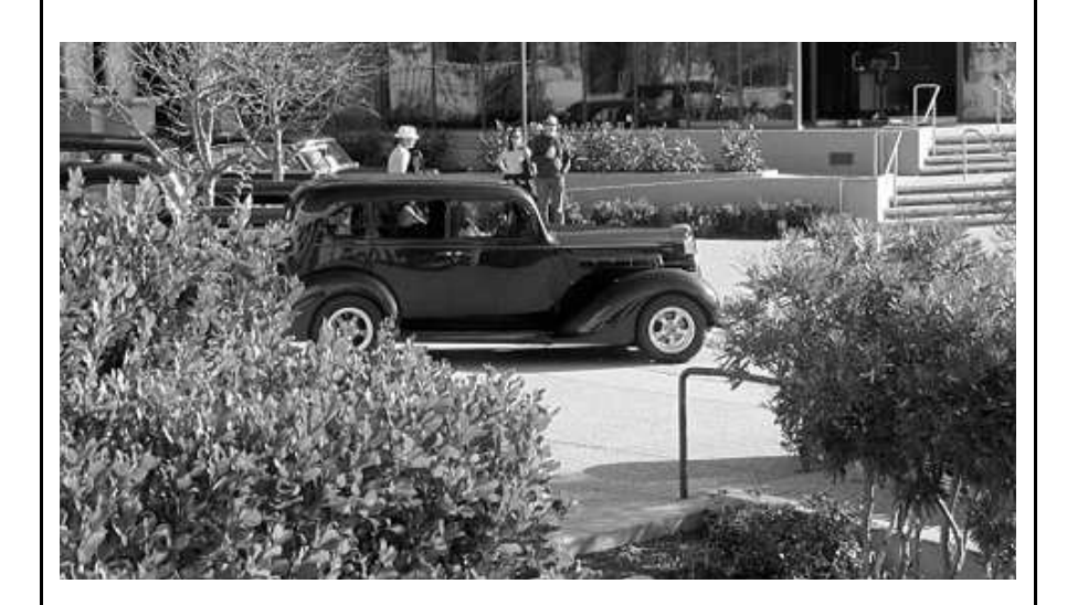
The Stephensons' '37 115-C sedan.