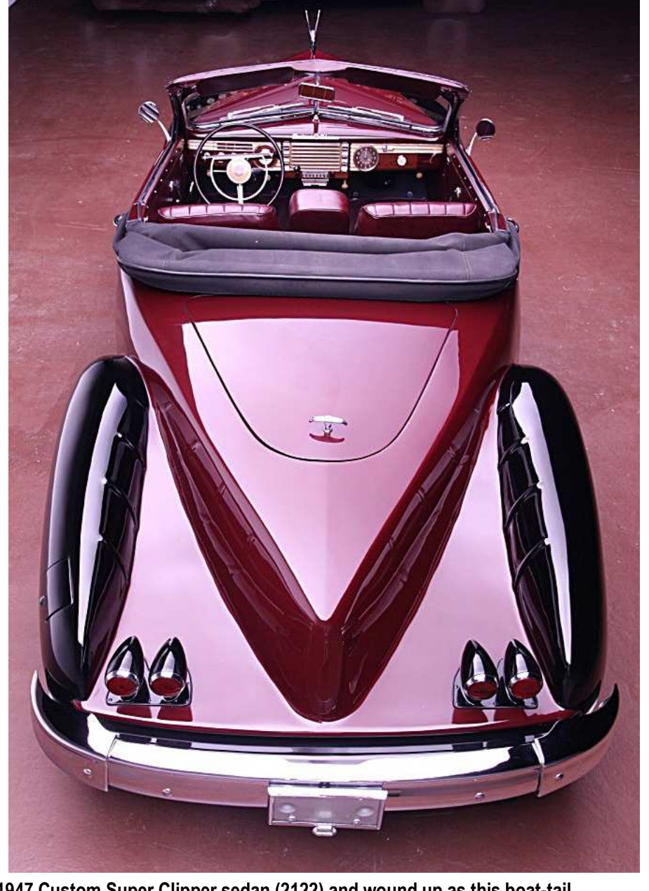
Packard News: Looking for a Packard to buy? Here is an interesting

one-off made up by an unknown custom shop in recent years. It started life as a 1947 Custom Super Clipper sedan (2122) and wound up as this boat-tail speedster. It has electromatic clutch and overdrive, with Edmunds heads and dual-carburetor setup. It is for sale at the Chicago Vintage Motor Carriage store for an asking price of $75,000.