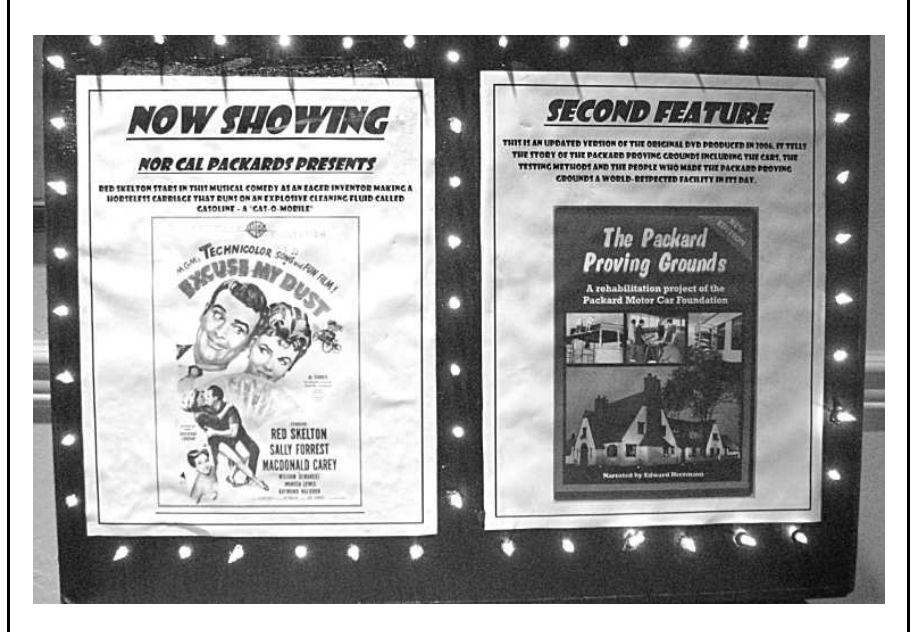
Nor-Cal Packards presents...

January 11, 2015