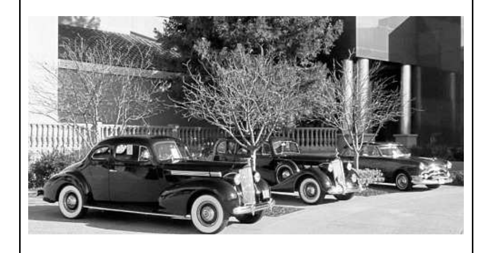
The Hills' '39 Eight coupe, the Becks' '37 Super 8 sedan, and Bill Young's '54 Clipper DeLuxe sedan.