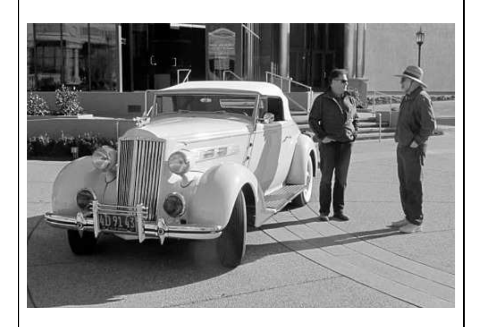
Chip Flor's '37 120-C convertible coupe.