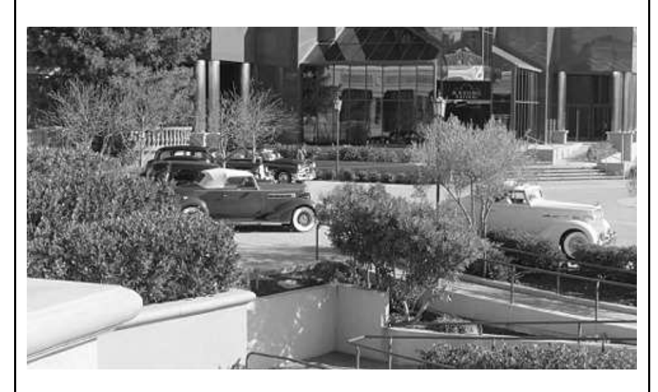
The Barchas' '36 120 convertible coupe at left.