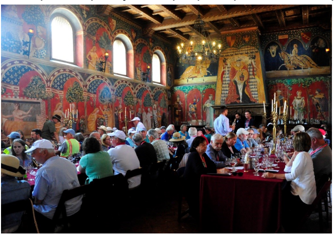
The Packard group wine tasting in the great hall of the Castillo di Amorosa.