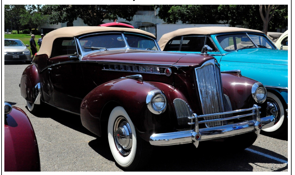
The 1940 180 Bohman & Schwartz Victoria, presumptive winner were there an award for longest hood, graces the parking lot at the DoubleTree host hotel.

Three extra years of planning, an army of volunteers and an outright gift from Mother Nature all contributed to making the 2023 National Meet a huge success. Originally slated for June 2020, the pandemic forced a postponement, however that also gave the planning committee the opportunity to hold the meet during the club's 70<sup>th</sup> anniversary in the region where the club was founded. Countless people from the Nor Cal Region and beyond stepped up in every possible way to ensure the meet would go as smoothly as possible. And ultimately, we enjoyed a classic California "sunny and mild" week, with just a bit of heat touching the show day – but nothing even close to the 112° we experienced in 2003!