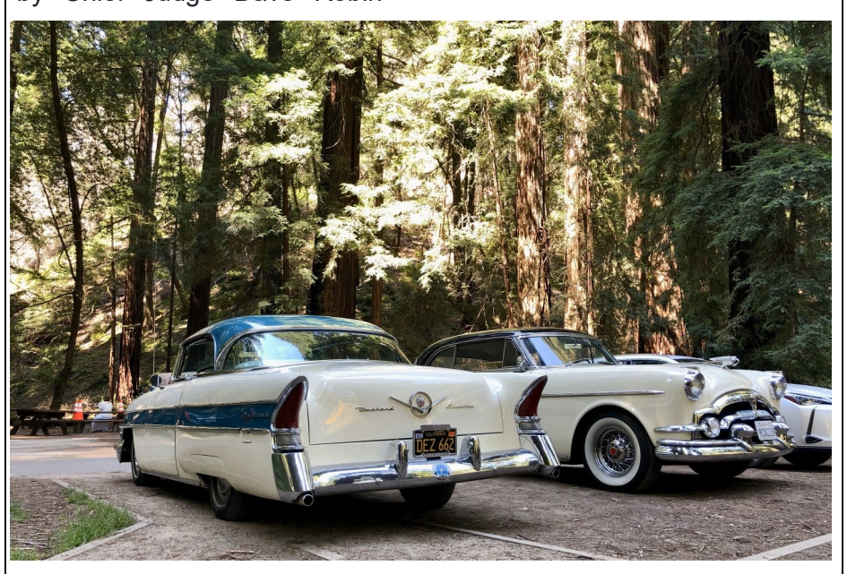
Continued on page 14