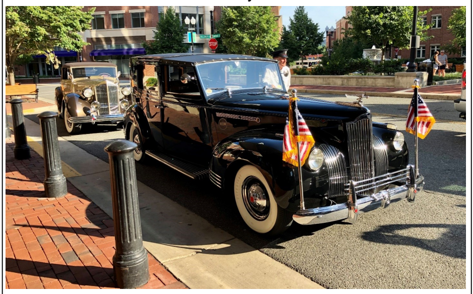
A very diplomatic 1941 120 Rollson Formal Town Car graces the curb in front of our host hotel, The Westin Alexandria Old Town.

For the first time since 2019, The Packard Club held its national meet on July 4-9, and it was a resounding success! Our nation's capital was the backdrop for a convergence of nearly 200 Packard enthusiasts from across the United States. Northern Californians were in no short supply either, as we had 7 members who made the trek. Packards in attendance ranged from 1930—1958, many of which were local cars, but one 1956 Patrician came all the way from Palm Springs, CA (after its trip to Western Regions in May)!