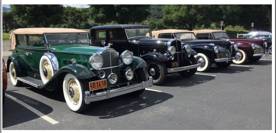
Clint Moore's 1932 903 Convertible Sedan at a past multi-make event that brought together an amazing display of Classics!